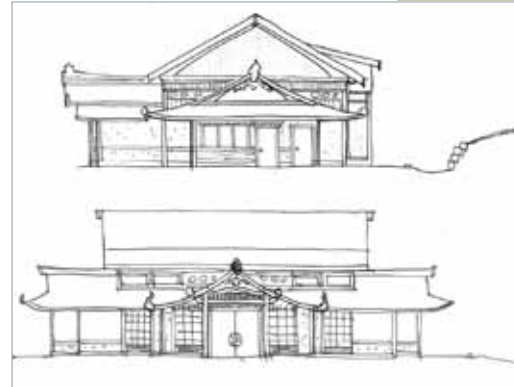
Phase 1 front and side view