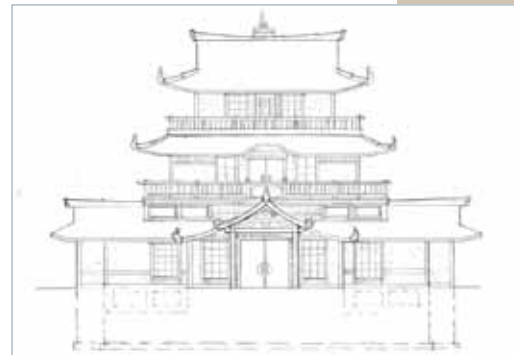
Complete Temple and Basement