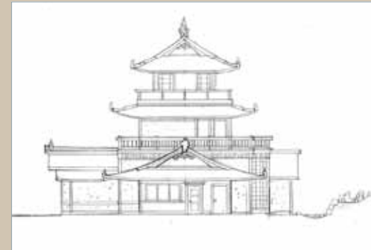
Complete Temple Side View